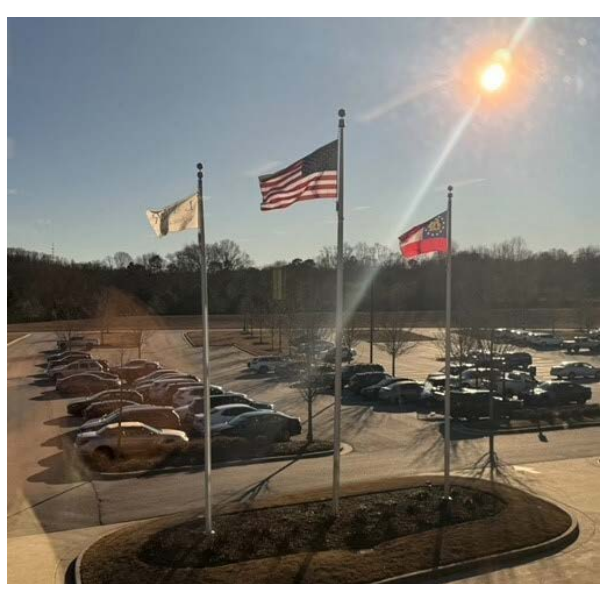
The view from the SSC at the Hall Campus